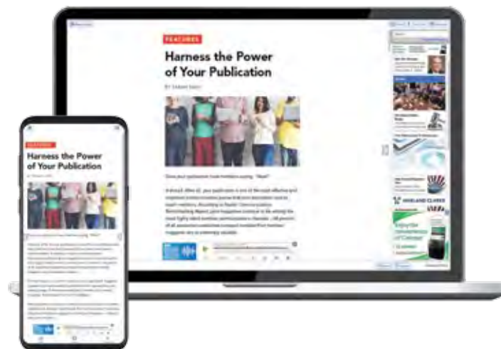
Mobile & Desktop Responsive HTML Reading View

Important Note: Readers can choose the experience best suited to their needs at any time by clicking on "Page View" or "Reading View" in the toolbar!