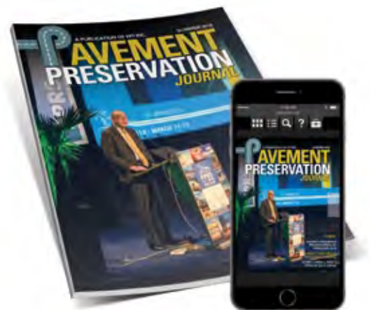
Pavement Preservation Journal print & digital magazine